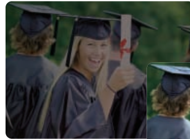
Power LCD "OFF"