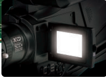
LCD light at 0 Lux Night View mode