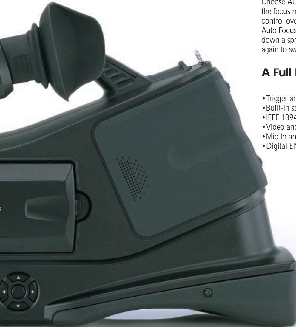
Double trigger and zoom lever on handle grip