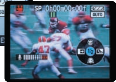
One Touch Navigation