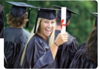
Power LCD "ON"