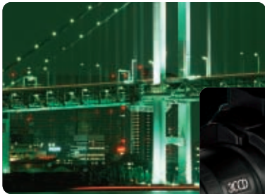
Color Night View Image